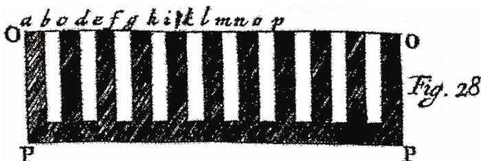
Figure 1. Hooke's (1674) figure for determining the limits of visual resolution.

“Now that any one may presently satisfie himself of the truth of what I assert, concerning the limited power of the naked eye, as to the distinguishing of Angles; Let him take a sheet of white Paper, and thereon draw two parallel Lines, as OO, and PP, in the 28 th . Figure, at four or five inches distance, then draw as many other small lines between them at right angles to them, and parallel one with another, as he thinks convenient, as aa, bb, cc, dd, ee, ff, gg, hh, ii, andc. and let them be drawn distant from each other an inch, then let him alternately blacken or shadow the spaces between them, as between aa and bb, between cc and dd, between ee and ff, between gg and hh, between ii and kk, between ll and mm, andc. leaving the other alternately white, and then let him expose this Paper against a Wall open to the light, and if it may be so that the Sun may shine on it, and removing himself backwards for the space of 287 \frac{1}{3} feet, let him try whether he can distinguish it, and number the dark and light spaces. And if his eyes be