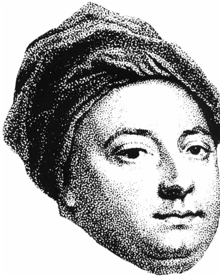
Figure 2. William Cheselden (1688 – 1752) after an illustration in Richardson (1900).

There was never any question amongst the philosophers whether the person with sight restored would be able to see post-operatively, but only whether they could name objects by sight alone. Physicians, on the other hand, were faced with the practicalities of vision in those with sight restored. In the early nineteenth century attention was drawn to the uniqueness of Cheselden's case, and the difficulties they had in making similar general statements from their own experiences.