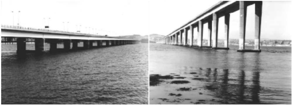
Figure 4. Photographs taken from the north (left) and south (right) sides of the Tay Road Bridge. The photographs were taken with the same settings from equivalent lateral distances from the piers, at about the same time of day, and at approximately the same height above water level. The bridge has an inclination of less than 1^\circ . If the bridge is considered to be parallel to the river then it has accelerated perspective from the south and decelerated perspective from the north. See caption to figure 1 regarding colour version of that figure.