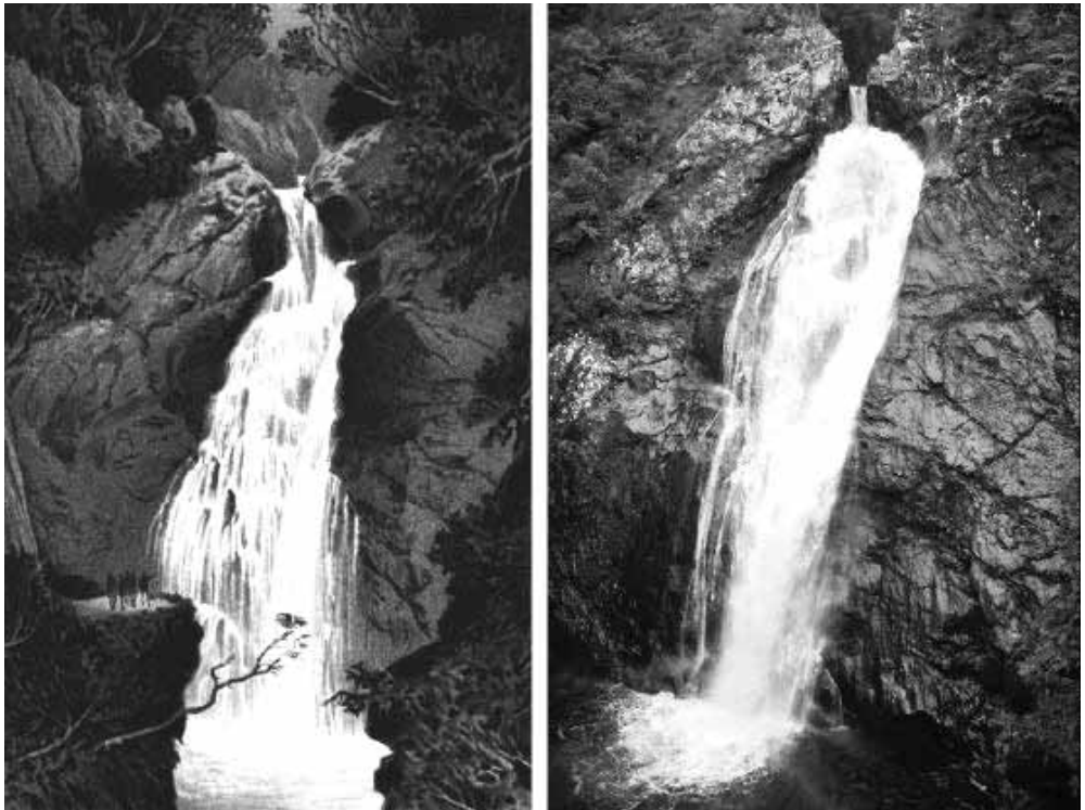
Figure 1. Left, a nineteenth century lithograph of the lower Fall of Foyers (from Tourist's Guide to the West Highlands ). Addams would have observed the falls from the observation point on the left, from which the photograph on the right was taken. This figure and figure 4 can be seen in colour on the Perception website at http://www.perceptionweb.com/misc/p3110ed/ .

This is not the case for the waterfall illusion. It was described in 1834 by Robert Addams after viewing the lower Fall of Foyers (figure 1) on the south-eastern side of Loch Ness in Scotland. Addams was a peripatetic lecturer on natural philosophy, who was visiting the celebrated falls during a tour through the Highlands. He was based in London, and was a scientific acquaintance of Michael Faraday and Charles Wheatstone. He supplied Faraday with carbonic acid for experiments at the Royal Institution, and he used Wheatstone's electromagnetic chronoscope in his lectures at the United Services Museum.