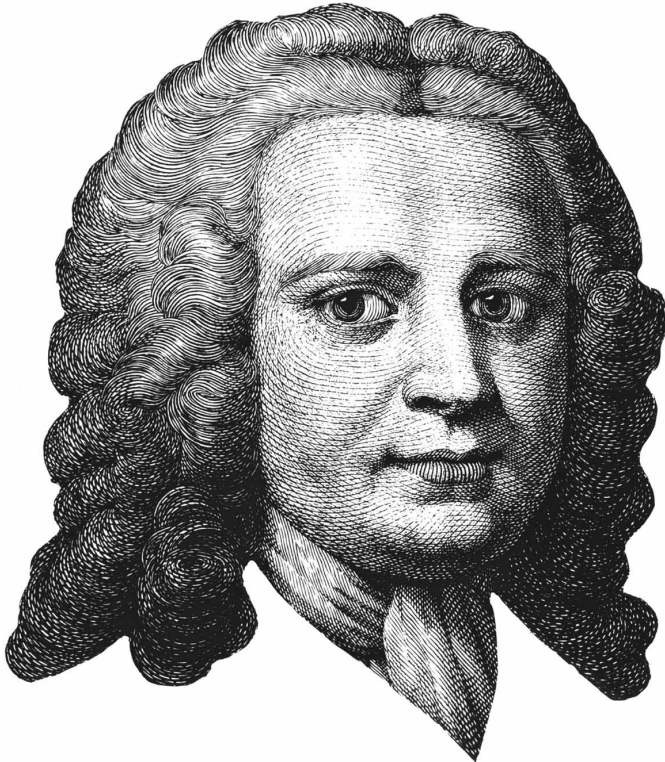
Figure 1. David Hartley (1705–1757) after a frontispiece engraving by William Blake in Hartley (1791).

David Hartley (figure 1), who was born three hundred years ago, sought to unite the physical and psychological worlds by means of a speculative neurophysiology. His sources of inspiration were Newton’s theory of vibrations, Locke’s principle of association, and a host of perceptual phenomena. He also drew heavily on Berkeley’s sensory-motor theory of vision.